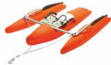
ACOUSTIC DOPPLER CURRENT PROFILER