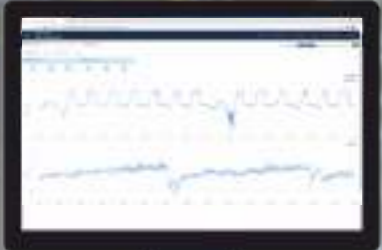
REAL TIME CLOUD