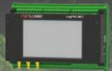
IOT GATEWAY & DISCHARGE CONTROLLER