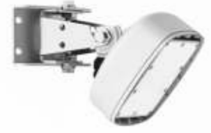
SURFACE VELOCITY RADAR